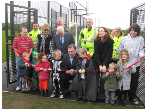
Thorpe MUGA Park Opening